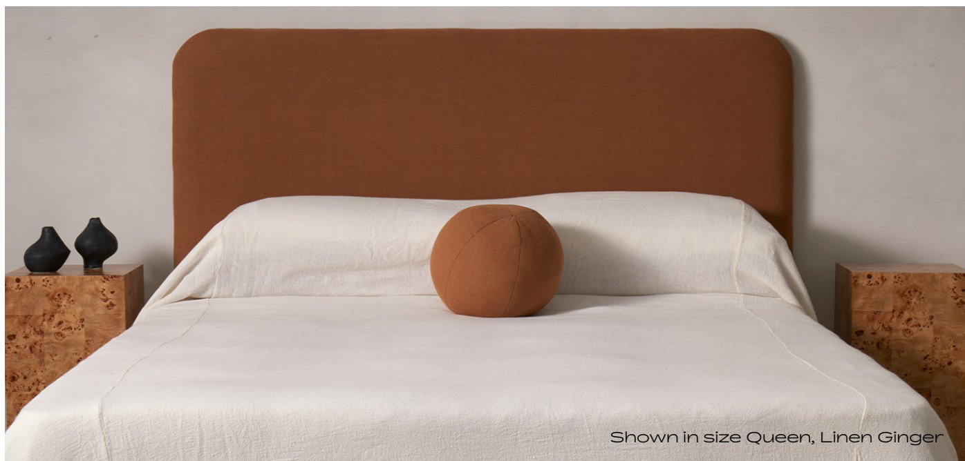
Shown in size Queen, Linen Ginger